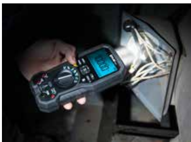
DM92 and DM93 feature powerful LED worklights