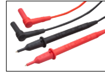
Premium silicone test leads included with both meters

* When registered within 60 days of purchase.