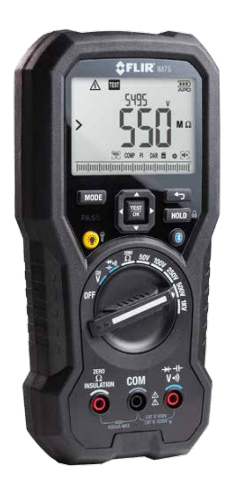
IM75 Features powerful worklights